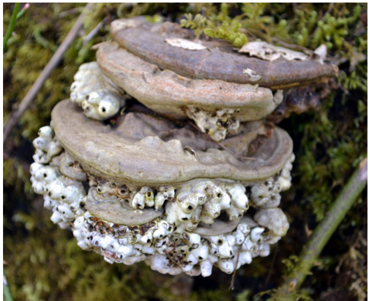
Ganoderma applanatum liberally infested with Agathomyia wankowiczii

One bracket worthy of note was a species warden Mick Jones mentioned that we should look out for: this was Ganoderma applanatum (Artists fungus) liberally covered in the galls of the fly Agathomyia wankowiczii (Yellow-footed fly) which is known to make its home in this specific fungus rather than in the very similar Ganoderma australis (Southern bracket). This particular specimen reminds one more of a block of flats, and there were several other similar apartment buildings on the same fallen Willow trunk.