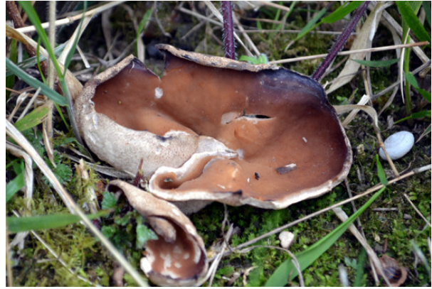
Scarcoscypha austriaca (left –) and Disciotis venosa (right –) found today.