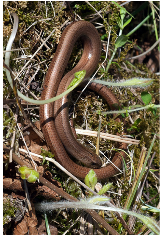
Slow-worm in the lagoon area (photo NW)

A party of ten of us gathered for our only spring foray of the year. We enjoyed a beautiful sunny morning though we feared that the previous dry spell meant we were unlikely to find much in the way of fungi, particularly agarics, and this proved to be the case. We chose to start by visiting the lagoon area which was likely to produce slightly damper conditions, and then moved across the road to the reserve proper where it was indeed amazingly dry and we found only a few things here to add to our rather meagre list of species. However, we feasted our eyes on a plentiful supply of wild flowers, saw four species of butterfly, several pheasant eggs apparently randomly dropped, and even found a slow-worm hiding away under a sheet of corrugated iron, whilst being serenaded by birdsong including the first of the spring migrants: blackcap and chiff-chaff.