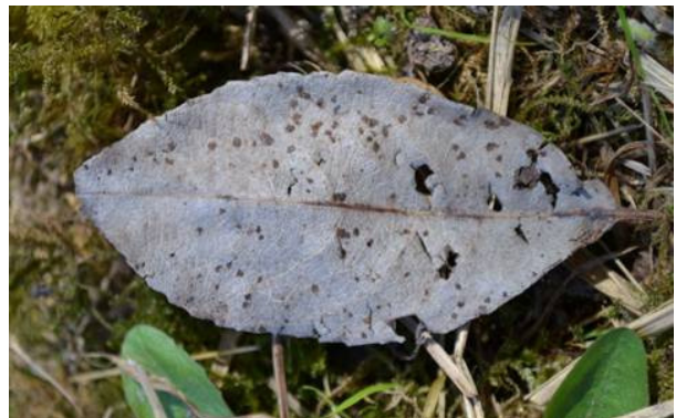
Cumminsiella mirabilissima (left) and Drepanopeziza salicis (right), both new to the county