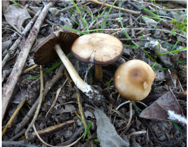
Psathyrella spadiceogrisea in the lagoon area

It was clearly too dry and also a bit early for us to be finding the large and distinctive Calocybe gambosa (St George’s mushroom) – often on foray lists at this time of year. It appears regularly around St George’s Day in grassy areas or path edges, and its whitish cap and gills and mealy smell make it easy to identify – one to be looking out for in the next few weeks, however.