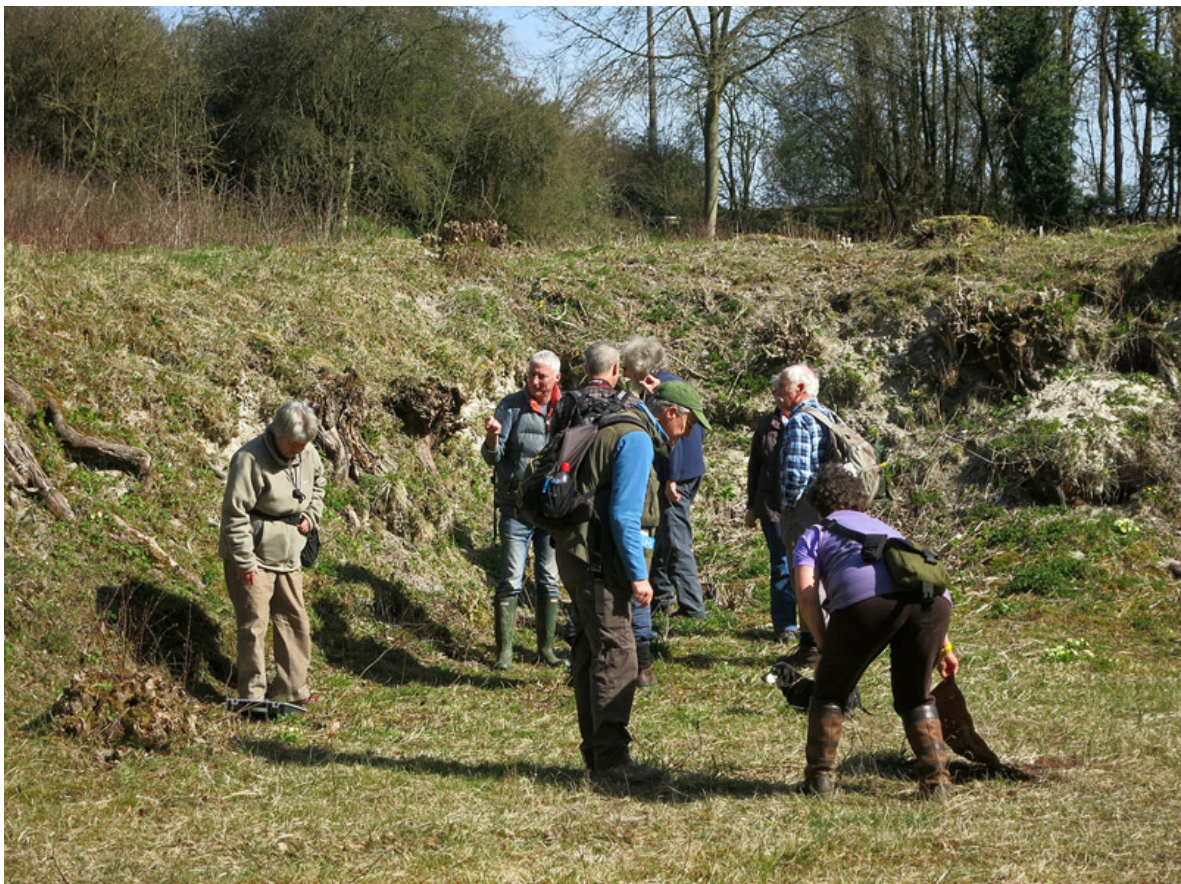
Forayers today at Dancersend lagoons

See the complete list for more details of what we found today.