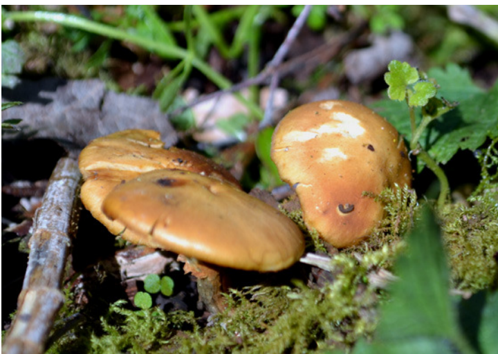
Galerina marginata on a log in the lagoon area (photo NW)

Normally our foray lists consist of a good number of agarics, considerably fewer ascos and a smattering of brackets and other assorted groups. (This is due in part to the fact that both Derek and I are considerably less knowledgeable and adept at identifying these other groups.) The exception comes at this time of year when very few agarics choose to fruit, and today just five of our list of 37 species had caps and a stem (the simplistic way to categorise agarics). First was a small species, ‘Mycenoid’ – i.e. similar in general appearance to one of the Bonnet caps) but rusty capped, rusty spored and having a clear ring on the stem. This told us that it was likely to be one of the 20 or so species of Conocybe which have a ring – Conocybe is a large and tricky genus with some 80 species mostly pretty similar in size, colour and shape, but those having a ring (soon to be split off into a separate genus Pholiotina ) are easier to sort out, and furthermore there is one which fruits mainly at this time of year, C. aporos , and Derek confirmed at home that this was indeed what we’d found. It was one of 14 species we found new to the site today.