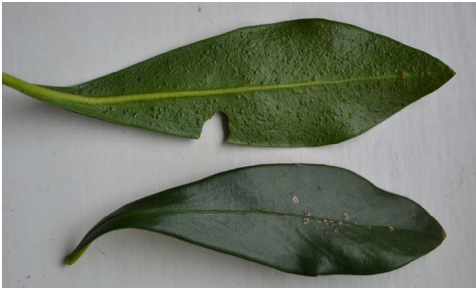
Marssonina daphnes (left), also new to the county