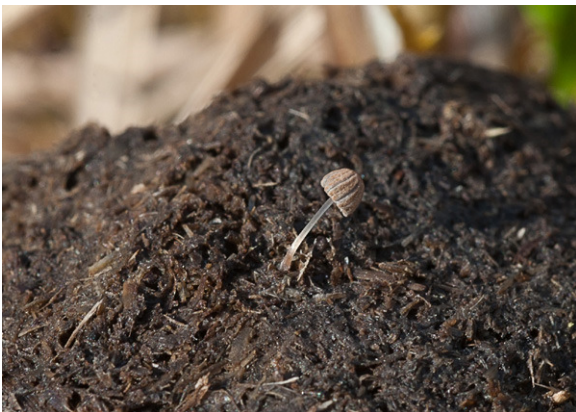
Parasola cuniculorum on horse dung